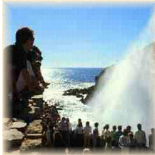
Ensenada, Baja California, Mexico

Vineyards, museums, whale watching, and beautiful beaches are some of the attractions to Ensenada. As the third largest city in Baja California, it is one of the most important ports on the Pacific Rim.